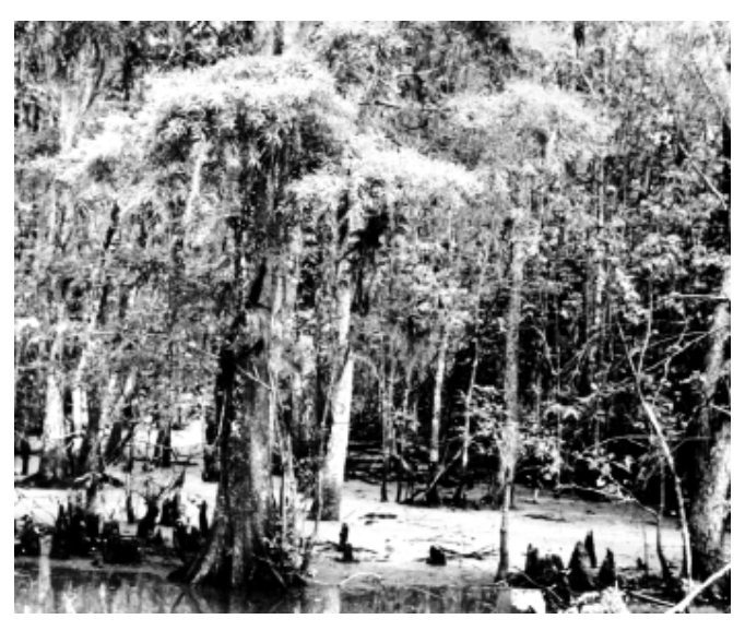
Figure 1–1. Cypress-tupelo swamp near New Orleans, LA. Species include baldcypress ( Taxodium distichum )), tupelo ( Nyssa ), ash ( Fraxinus ), willow ( Salix ), and elm ( Ulmus ). Swollen buttresses and "knees" are typically present in cypress.