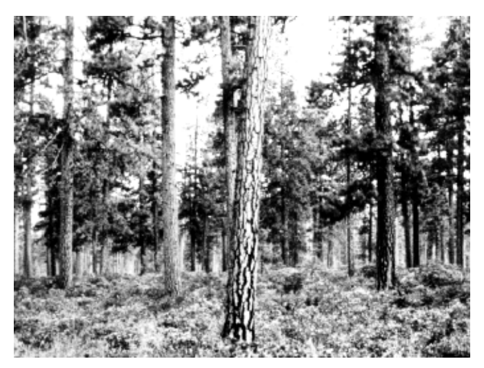
Figure 1–3. Ponderosa pine ( Pinus ponderosa ) growing in an open or park-like habitat.

Sapwood of pond pine is wide and pale yellow; heartwood is dark orange. The wood is heavy, coarse grained, and resinous. Shrinkage is moderately high. The wood is moderately strong, stiff, moderately hard, and moderately high in shock resistance.