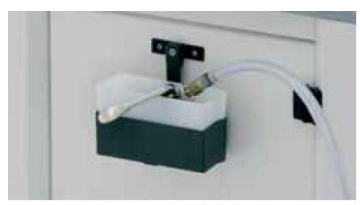
Place the nozzle in the water resevoir after use.

Since Pizzi systems are pressurized gluing systems, having a maintenance plan which maintains your tanks and nozzles at regular intervals- after use, weekly, monthly, and yearly- is critical to the overall performance of the system. The Pizzi system requires very low maintenance. Performing basic clean-up and regular care will ensure your system's longevity and high performance.