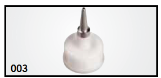
Check the 003 nozzle for normal wear and tear.

Inspect for glue buildup on the threaded end.