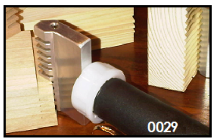
Take special care with brush nozzles. Be sure to flush the gaps in the 0029 attachment.